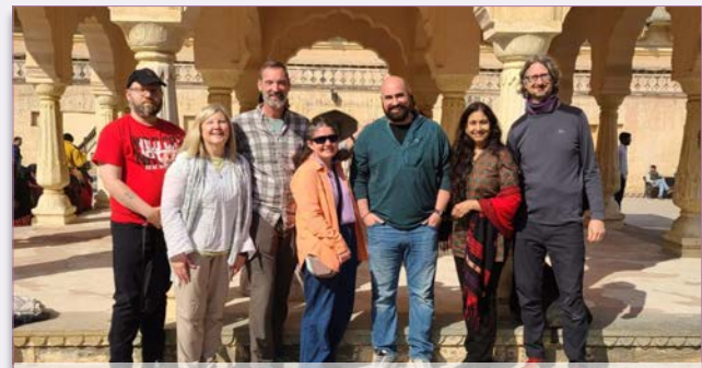
Honors Faculty in India