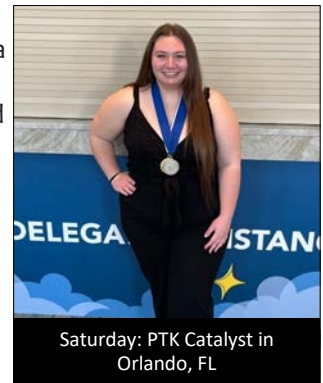
Saturday: PTK Catalyst in Orlando, FL

On Thursday, April 4th, I embarked on an unforgettable journey with Phi Theta Kappa to attend Catalyst and accept an award. Being internationally recognized as one of PTK's most distinguished members as a first-year participant is incredibly honorable, as this distinction is exceptionally rare.